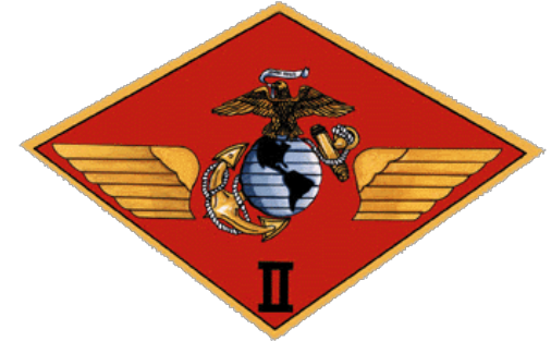
2D Marine Aircraft Wing MCAS Cherry Pt NC