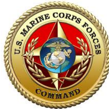
Marine Forces Command Norfolk VA