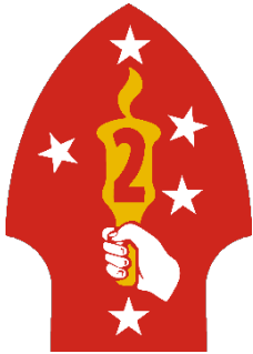
2D Marine Division Camp Lejeune NC