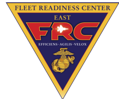
Fleet Readiness Center-East MCAS Cherry Pt NC