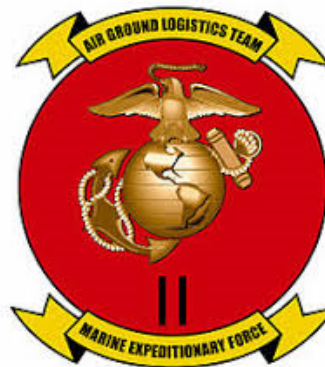
II Marine Expeditionary Force Camp Lejeune NC