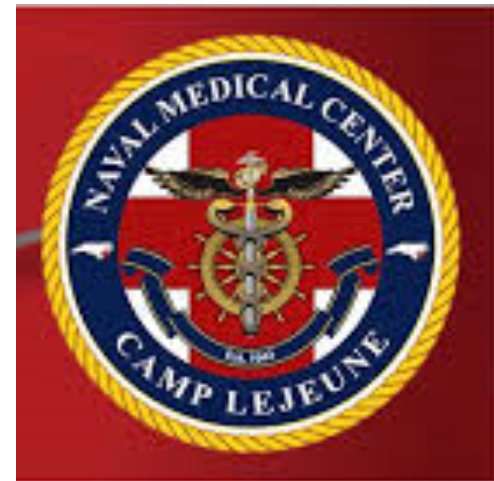
Naval Medical Center Camp Lejeune