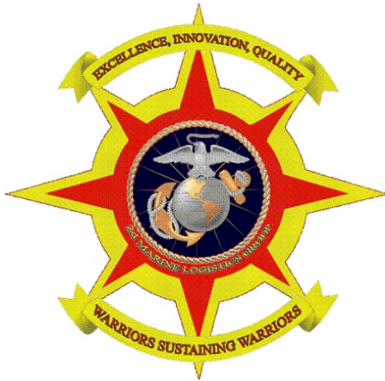
2D Marine Logistics Group Camp Lejeune NC